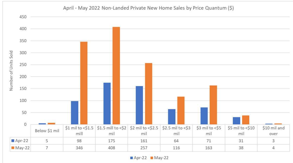
Chart 2: Private Non-landed New Home Sales by Price Quantum in April & May 2022

Source: PropNex Research, URA Realis (data retrieved on 15 June 2022)